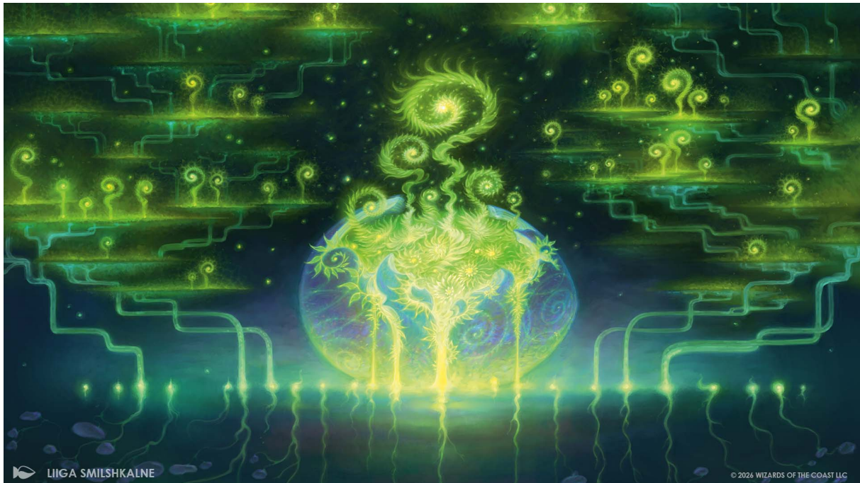
Planar Engineering

the nature of Valgavoth. Zimone inspects it now, sees how the House's tendrils prod at other pinpricks of light.