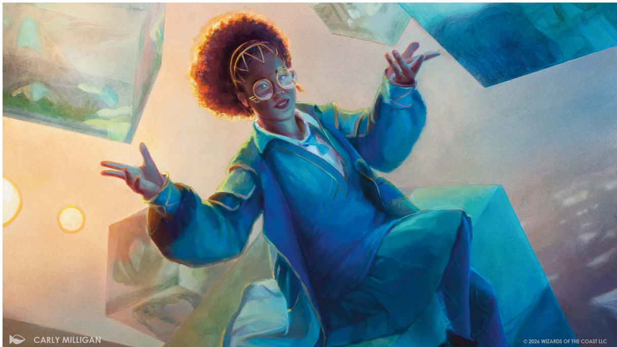
Zimone, Infinite Analyst

There were proper meals at Strixhaven. She remembers goat curries and lamb pies, crisp layers of croissant, and as much cider as she could guzzle. How many perfect meals did she absentmindedly horf down while researching her thesis? Zimone dumps her noodles and broth into a repurposed coffee mug and douses it in white pepper and red mystery pepper flakes, then cracks an egg in the middle. See? A balanced, hot, perfectly normal dinner. Zimone is fine .